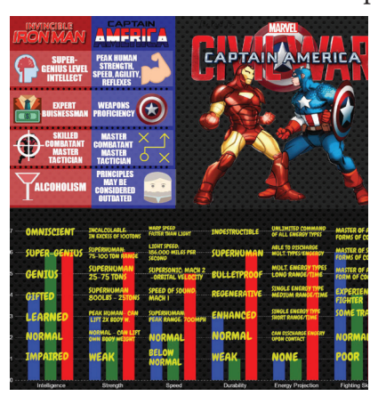
Figure 3: a comparison between the Captain America and Iron Man power level

It is probably for this reason that readers attempt to elaborate unofficial ranks and leaderboards of characters strength, trying to systematize the logic of power in these fictional universes. As a retrospective attempt to satisfy readers, Marvel created a Power Grid of Marvel Heroes in the Official Handbook of the Marvel Universe . For each hero, the power grid measures strength in 6 attributes, divided in seven tiers, ranging from one (weaker than common man) to seven (god-like power).