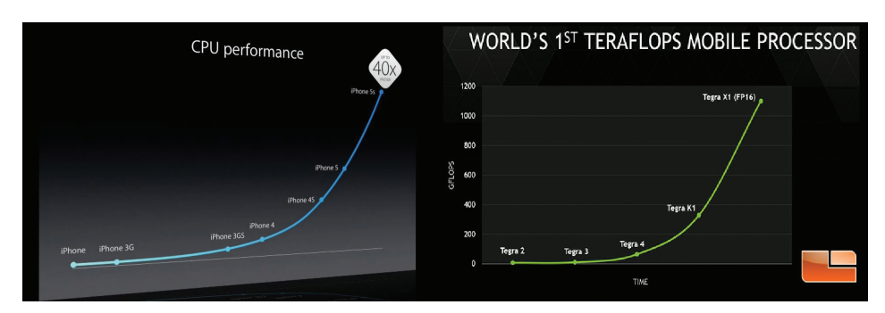
Figure 4: the graphs of Apple (left) and NVidia (right) SoC increase in Competence

a) It is now a common trend for the producers of IT components such as NVidia, Apple or Arm, to officially present their new products during specific conferences, aimed at the tech-savvy public. The structure of the discourse used during this presentation seems to follow the key traits of the Apeiron narratives, even in a rough and imprecise way: