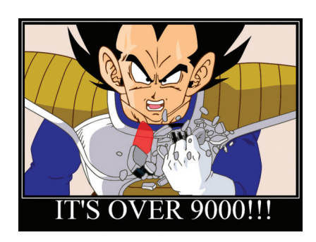
Figure 1: the original image of the "it's over 9000" meme

"It's over 9000" is one of the first and most famous memes still used on the internet: it is generally used in messages as a reply to incredible values or numbers, often ironically or to imply an excess in forecasts or predictions. In recent years, its success served as a starting point for practices of meme remix-remake, which could be called a meta-meme.