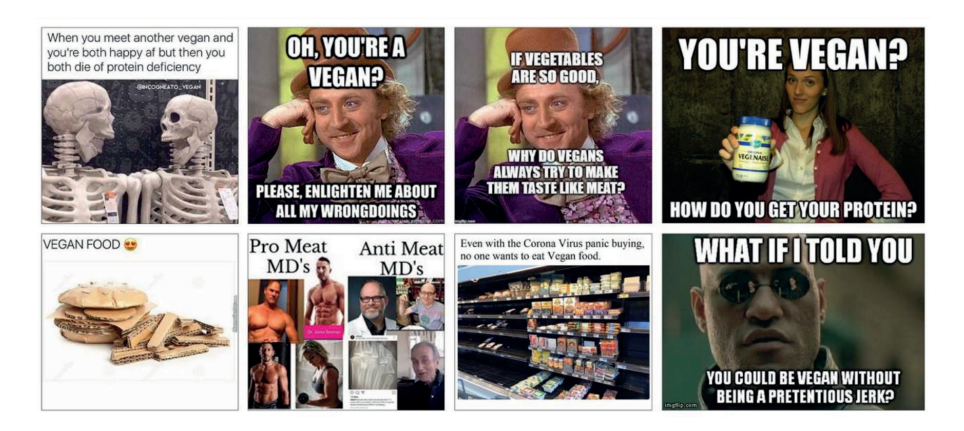
Fig. 3: Examples of Internet memes laughing at veganism.

A number of memes (Fig. 3) and other messages circulating throughout Web 2.0 have reinforced such visions and valorisations, also exploiting other stereotyped figures, such as that of the "weak", not fully healthy vegan, who needs to artificially integrate (e.g. by means of supplements or enriched foods) nutritional elements into his/her diet, or that of the preachy, and even hostile, vegan, who has a sense of moral superiority and tries to convert everyone who is not vegan. Sexual and gender-related provocations have also been frequently used, reinforcing the attribution of machis mo to the consumption of meat and other stereotypes associated with sexuality.