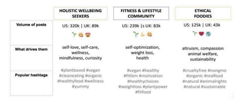
Fig. 1: Linkfluence's social data research into the rise of veganism and plant-based diet in 2018.

Such a classification, also confirmed by similar research findings, reflects a main opposition. In certain cases, veganism has a "use value" (cf. Greimas & Courtés 1979), since it allows the subject to realise a junction with a second order object, i.e. health or well-being (in a practical valorisation , in