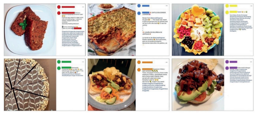
Fig. 2: Examples of visual posts concerning vegan food<sup>7</sup>.

Moreover, as is usual in the food porn aesthetics, products are chosen and associated with each other to create appealing eidetic and chromatic combinations (generally enhanced by means of filters and editing techniques, such as brightness, colour and saturation, to appear more visually pleasing), with the level of expression capturing the observer's attention and concurring to the attenuation of the differences among different food categories, including vegan and non-vegan products (which is of particular interest, as we will discuss in what follows).