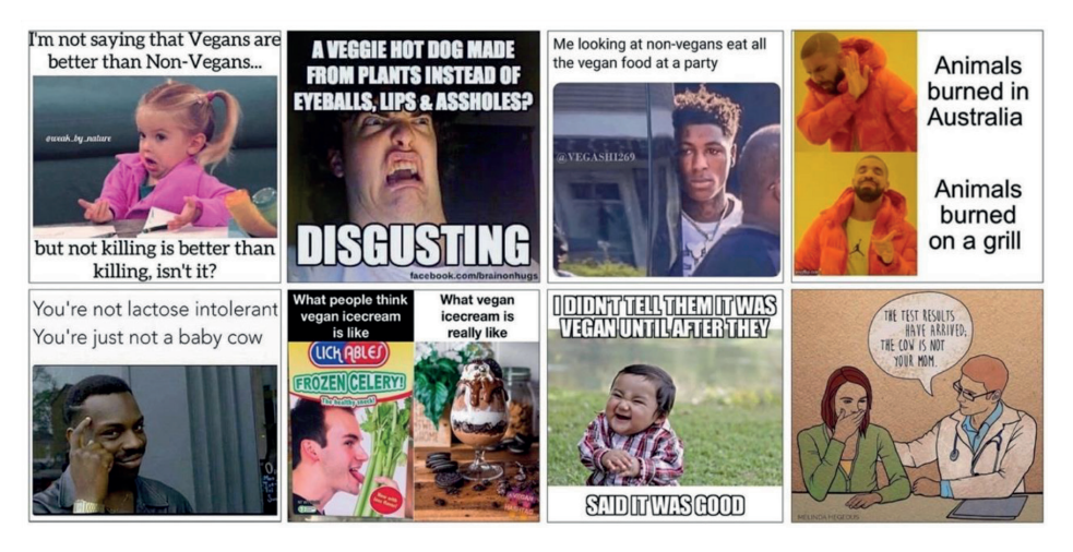
Fig. 4: Examples of Internet memes parodying anti-vegan claims.

In the exact same way as carnist memes, these messages operate a semantic inversion ( antiphrasis ), that is to say, a "reversal of perspective" (Russo Cardona 2009) which overturns the reference points of the interlocution, by originating a new sense of the involved situation and a subversion of the common point of view on veganism. These same mechanisms are at work also in more complex texts. Following the Covid-19 outbreak in Europe and the US, for instance, a post caught the attention of hundreds of people on Reddit , an American social news aggregation, web content rating, and discussion website that has a page specifically devoted to veganism (https:// www.reddit.com/r/vegan/) (Fig. 5).