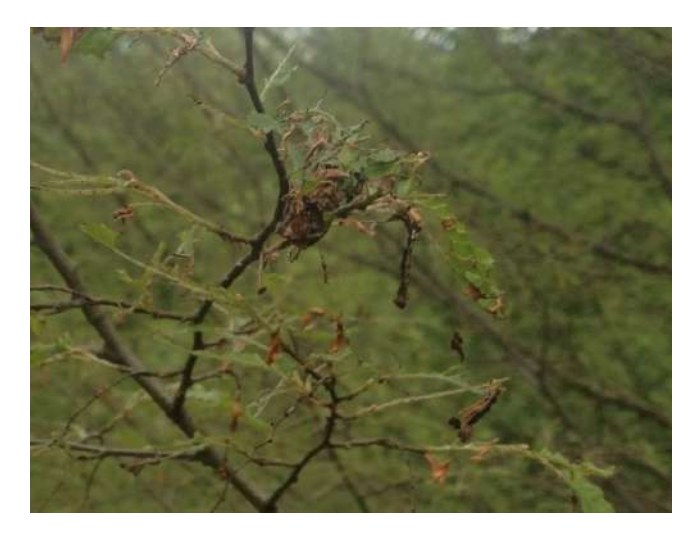
Fig. 2. Dead larvae of Erannis defoliaria hanging from tree branches full with conidia and resting spores of Entomophaga aulicae

E. auliciae is distributed in the North hemisphere and has a wide range of lepidopteran hosts – Arctiidae, Geometriidae, Erebidae, Noctuidae, Pyralidae and Tortricidae [Balazy, 1993]. Epizootics caused by E. auliciae was observed for the first time in 2000 in larvae of the brown tail moth Euproctis chrysorrhoea in Bulgaria [Pilarska et al. 2001]. The authors established the pathogen in 16 out of 72 sites with brown tail moth infestation in Balkan, Sakar, Sredna Gora and Rodope Mountains. Later E. auliciae was found again in the same host in the region of town of Asenovgrad where it caused also a strong epizootic [Pilarska et al. 2018].